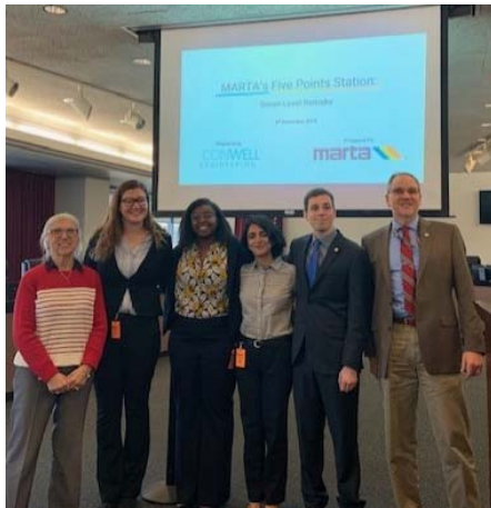
GT Capstone Students Present Their Findings