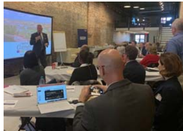
Columbus Mayor B.H. "Skip" Henderson III Gives Opening Remarks