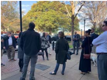
Walking Tour of Uptown Columbus

On January 15, the City of Columbus, along with a team from Georgia Tech hosted an engagement workshop as part of the GA Smart Communities Challenge . In June of 2019, Columbus was selected as one of four communities chosen by the Georgia Tech initiative to implement cutting-edge smart technologies in Georgia communities. The Georgia Smart Communities Challenge provides seed funding, access to technical assistance, expert advice, and a Georgia Tech research partner to conduct research and advise each team.