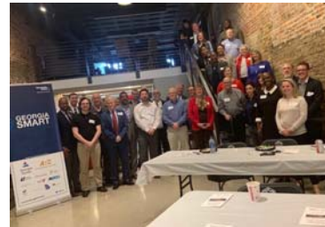
Workshop Attendees at Pop UPTown